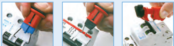
B090848 - PIN-IN