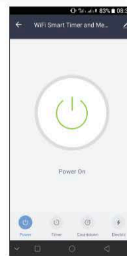
Power On/Off Function