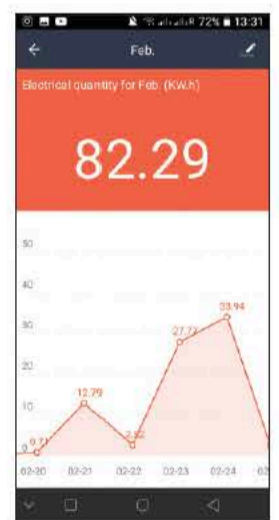
Power Consumption Statistics