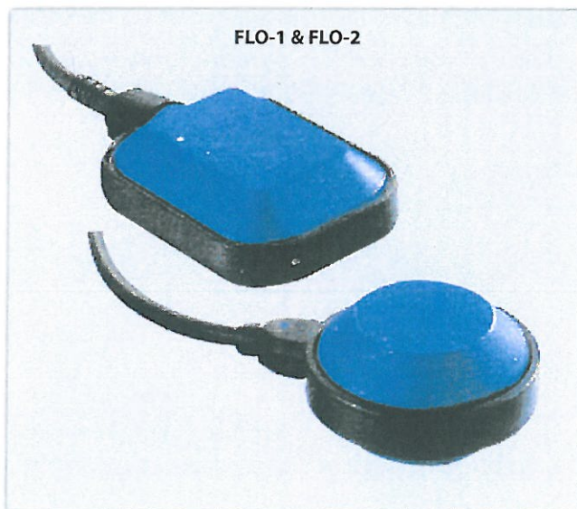
FLO-1 & FLO-2

Can be used in all applications where accurate control of water level is required.