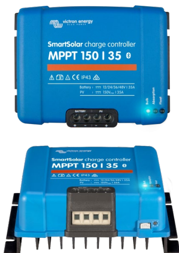
SmartSolar Charge Controller MPPT 150/35